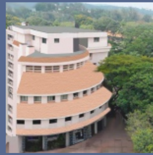
Achutha Menon Centre (AMC)