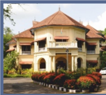
Bio Medical Technology Wing